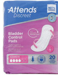
Attends® Discreet Women's Moderate Bladder Control Pad* Count: 20 ct.