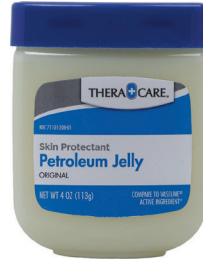
Petroleum Jelly, 4 oz. Count: 1 ct.