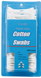
Cotton Swabs Count: 300 ct.