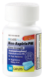
Acetaminophen PM Extra Strength Caplets, 500 mg., 25 mg. Count: 50 ct.