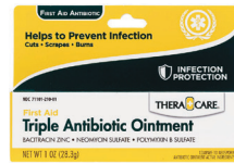
Triple Antibiotic Ointment, 1 oz. Count: 1 ct.