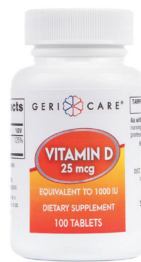
Vitamin D3, 25 mcg.† Count: 100 ct.