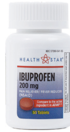
Ibuprofen Tablets, 200 mg. Count: 50 ct.