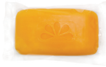
Anti-Bacterial Bar Soap Count: 1 ct.