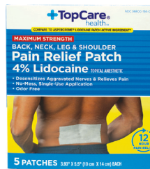
Lidocaine Patch, 4% Count: 5 ct.