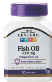
Fish Oil Softgels, 1,000 mg.‡ Count: 60 ct.