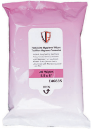
Feminine Hygiene Wipes Count: 40 ct.