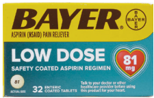
Bayer® Enteric Coated Aspirin, Low Dose, 81 mg. Count: 32 ct.