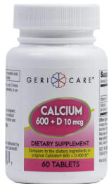
Calcium + Vitamin D3 Tablets, 600 mg.† Count: 60 ct.