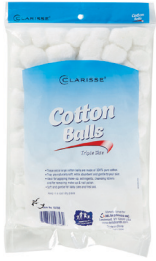
Cotton Balls Count: 100 ct.