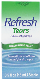
Lubricating Eye Drops, Refresh Tears®, 15 ml. Count: 1 ct.