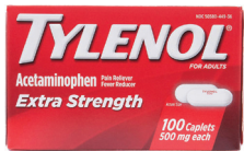
Tylenol® Extra Strength Tablets, 500 mg. Count: 100 ct.