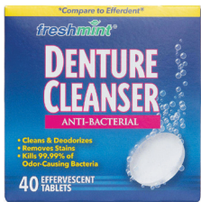
Denture Cleaning Tablets Count: 40 ct.