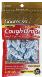
Cough Drops, Sugar-Free Count: 25 ct.