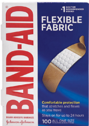
Band-Aids®* Count: 100 ct.