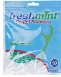
Interdental Flossers Count: 90 ct.