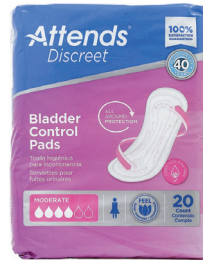
Attends® Discreet Women's Moderate Bladder Control Pad* Count: 20 ct.