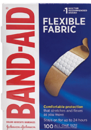
Band-Aids®* Count: 100 ct.