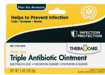
Triple Antibiotic Ointment, 1 oz. Count: 1 ct.