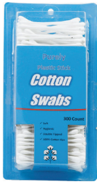
Cotton Swabs Count: 300 ct.